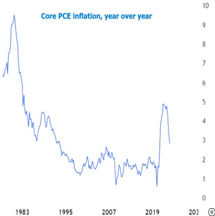
Core PCE inflation, year over year

While it's no longer necessarily a top priority, the Fed would also not mind seeing some more slack in the labor market and some other signs of economic weakness to bolster the case for further disinflation. If the economy is too strong, they need to wonder if inflation might pick back up.