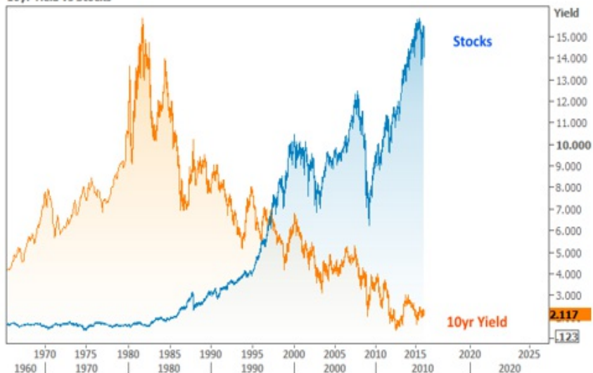
10yr Yield vs Stocks

There's no trick involved with this chart. Bond yields really did fall consistently since the early 80's while stocks exploded higher. It's only when we zoom in to much shorter time scales that we see the correlation.