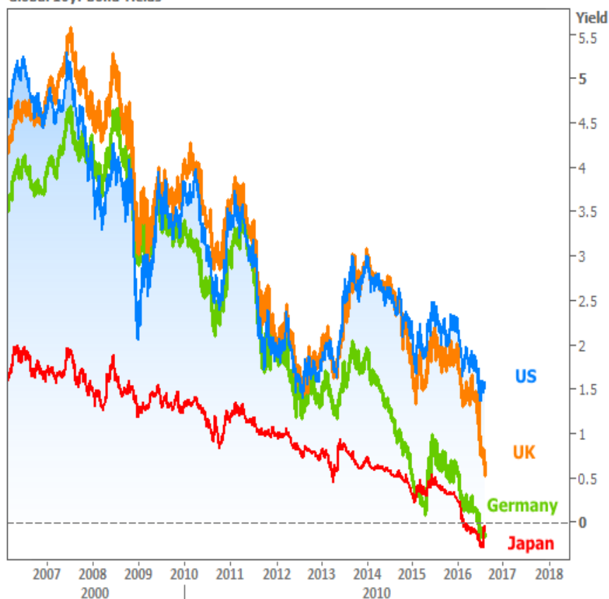
Global 10yr Bond Yields

It's this big picture correlation--this global race to the lowest rates--that drives the long term trend lower. Short term trends toward higher rates are merely a necessary byproduct of the larger-scale downtrend. Sometimes, these moves higher in rates will line up with moves higher in oil and stocks, but it's central banks that will ultimately set the tone.