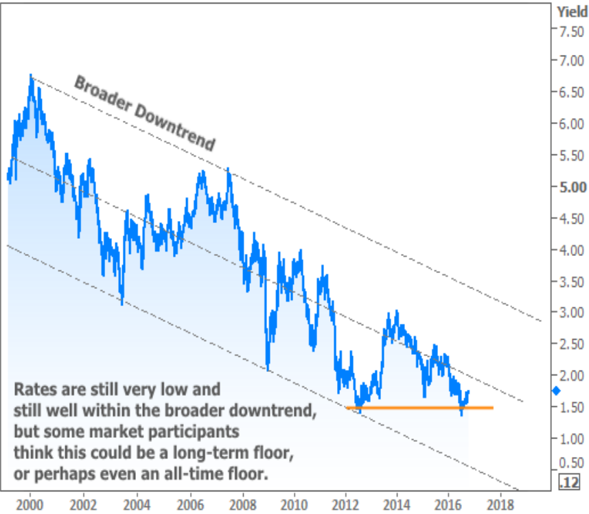
10yr Treasury Yields

Subscribe to my newsletter online at: http://mortgagenewsletter.net/timothybaron