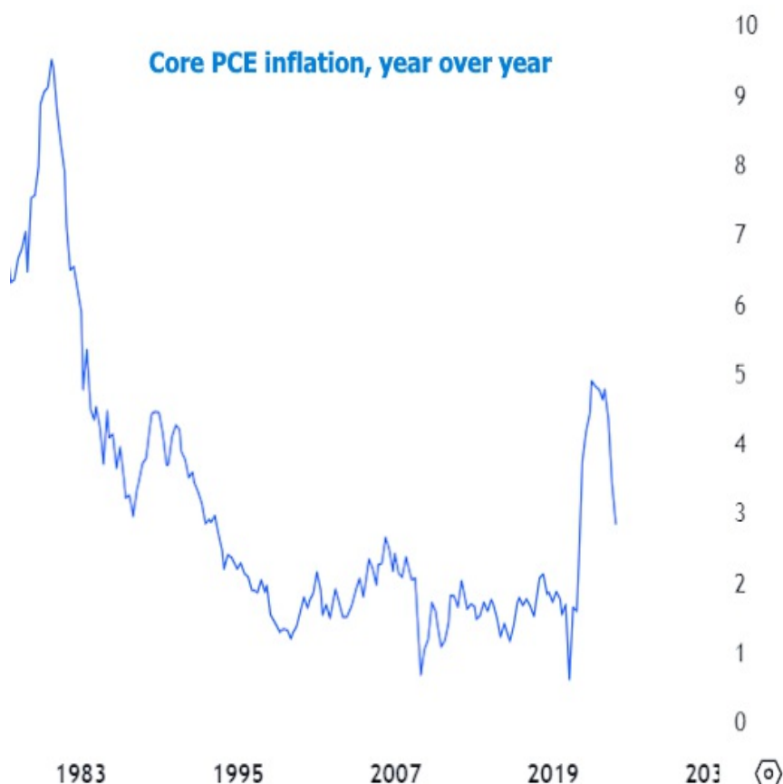
Core PCE inflation, year over year

While it's no longer necessarily a top priority, the Fed would also not mind seeing some more slack in the labor market and some other signs of economic weakness to bolster the case for further disinflation. If the economy is too strong, they need to wonder if inflation might pick back up.