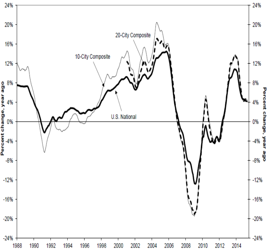
S&P/Case-Shiller Home Price Indices

Source: S&P Dow Jones Indices & CoreLogic