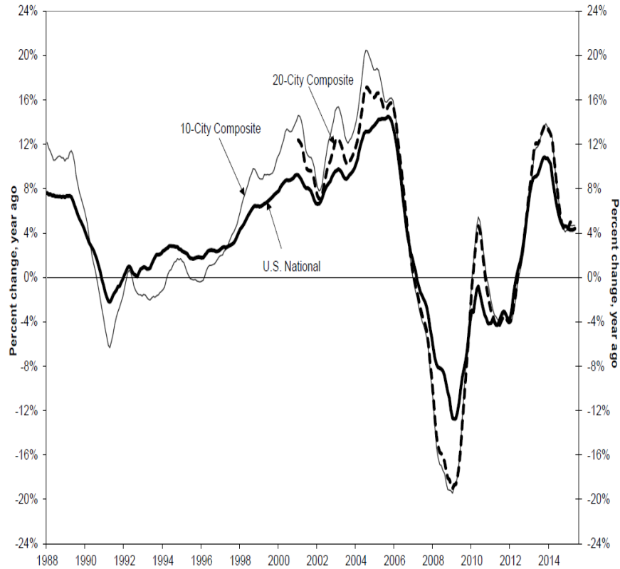
S&P/Case-Shiller Home Price Indices

Source: S&P Dow Jones Indices & CoreLogic