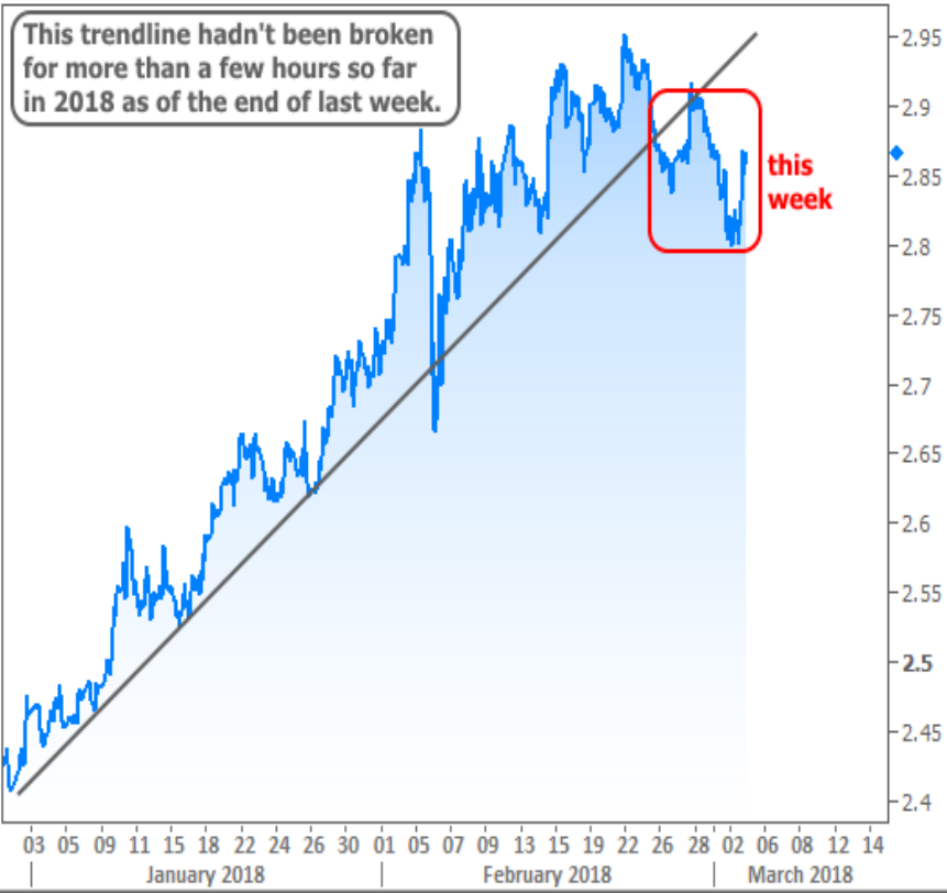
US 10yr Yield ("rates")