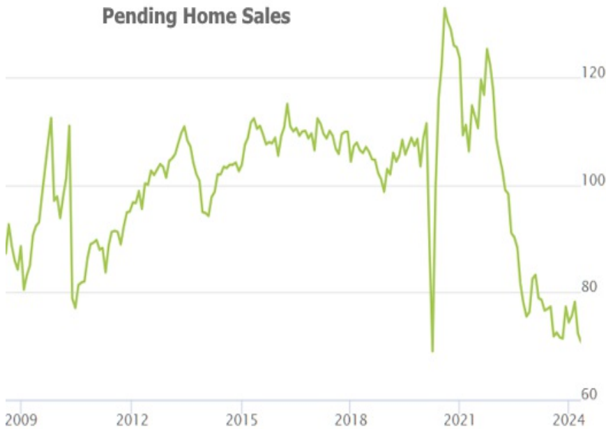
Pending Home Sales

Sales of new homes are also near their recent lows, but remain much higher relative to pre-pandemic levels.