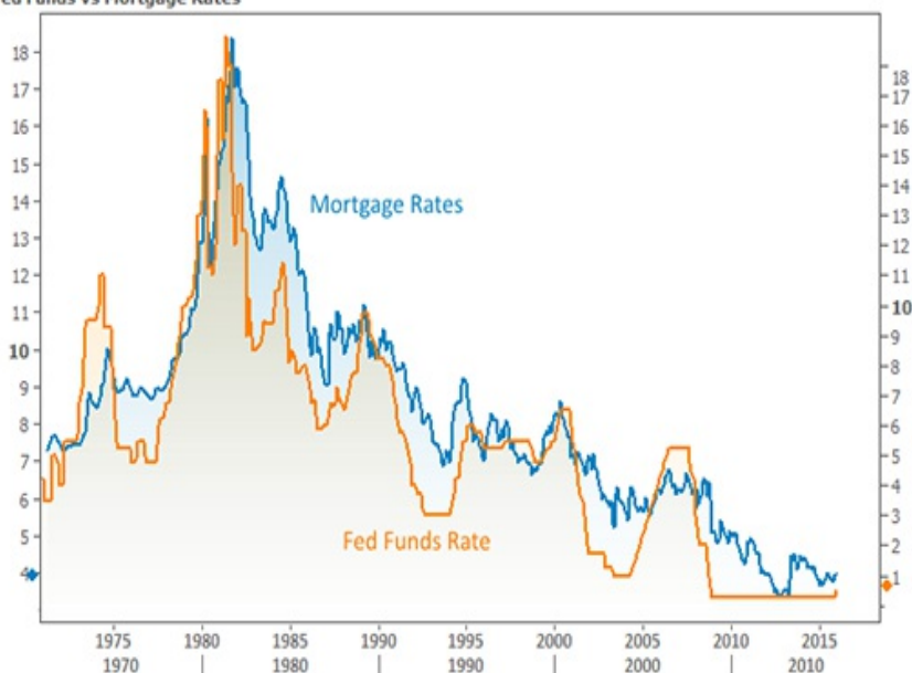
Fed Funds vs Mortgage Rates

What the chart DOESN'T show —at least not as obviously—are the subtleties that help brighten the outlook. First of all, notice the last Fed hike in 2004. At the time, mortgage rates actually moved slightly lower just after the Fed raised rates. The reasons for that are similar to the present-day reasons.