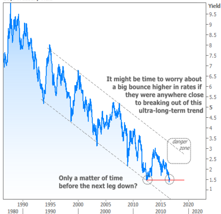
10yr Treasury Yield

Not only are we not even close, it would be easier to argue an impending move to new all-time lows. To be clear, rates can always move higher. I'm merely saying that, based on the charts, the decades-long trend toward lower rates is alive and well . People have been forecasting its demise for years, but it's not time to freak out yet.