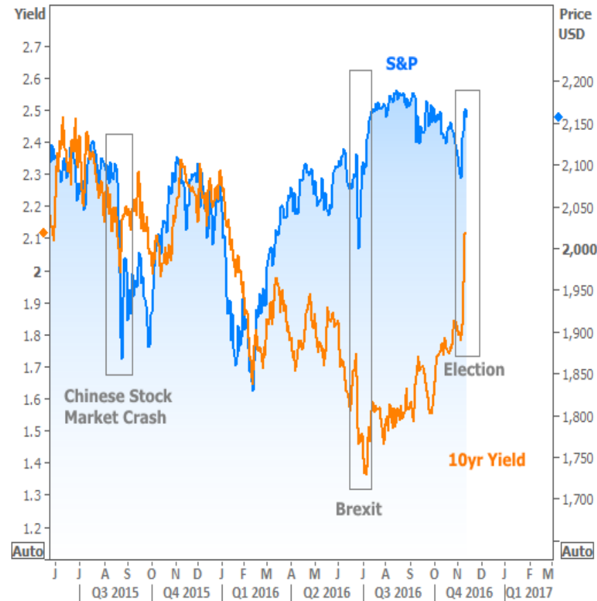
Stocks vs Bonds

By a decisive margin, the last 2 days of this week were the worst 2 days for rates since the taper tantrum in June 2013. The existing uptrend in rates was completely shattered, and history suggests there's still a chance of more pain ahead.