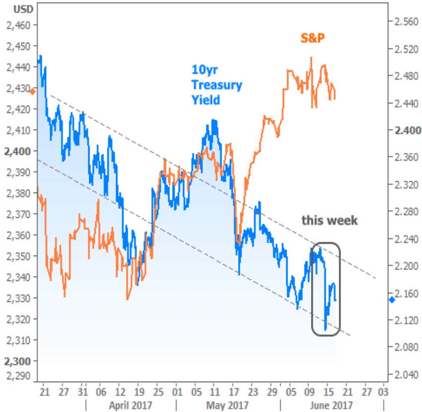
Rate Trend Remains Friendly

In housing-specific news, this week's economic data was generally downbeat . The National Association of Home Builders reported a drop in its Housing Market Index (a measure of builder confidence). In context, however, the index doesn't look like it's in trouble just yet.