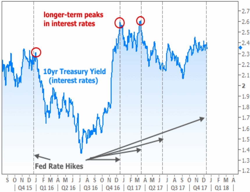
Rates and Rate Hikes

Other parts of this week's Fed communications were still important , but they actually helped rates move LOWER. Chief among these were the Fed's economic projections .