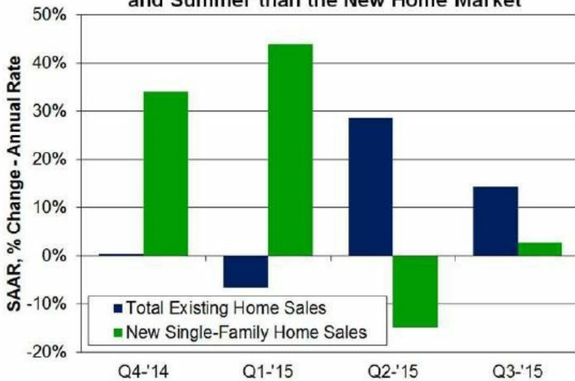
The Existing Home Market Sees Better Spring and Summer than the New Home Market

New home sales , which had increased strongly for the two prior months, plummeted in September taking the average for the third quarter down to near the average for the second quarter. Although inventories of new homes have increased on an annual basis every month since January 2013 it is likely a tight supply of more affordable units that is contributing to soft sales. Existing sales, however rebounded in September and for the third quarter as a whole those sales have a double digit annualized gain.