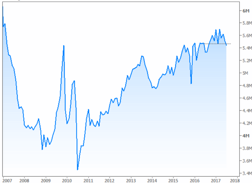
Existing Home Sales

Single-family home sales decreased 0.8 percent to a seasonally adjusted annual rate of 4.84 million from 4.88 million in June and were 1.7 percent above the 4.76 million pace a year ago. Existing condominium and co-op sales fell 4.8 percent to a seasonally adjusted annual rate of 600,000 units in