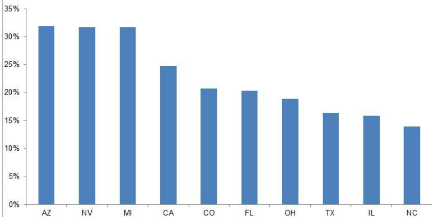
Figure 3: Hardest Hit States Had Most Boomerang Homeowners Return Share of Foreclosed Borrowers Between 2007 - 2013 that Returned