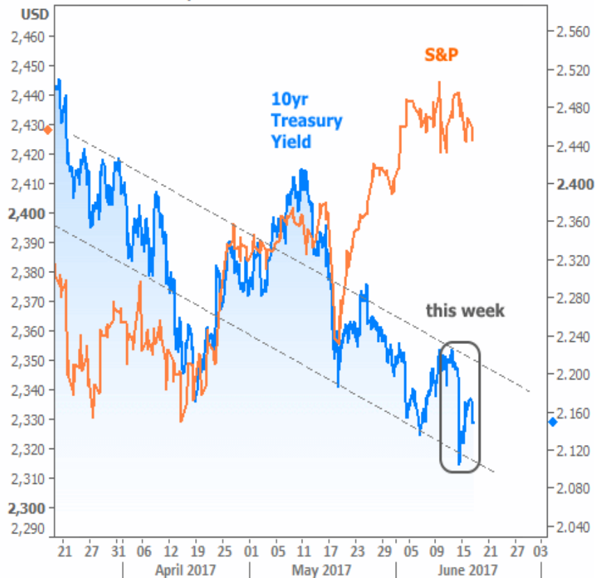
Rate Trend Remains Friendly

In housing-specific news, this week's economic data was generally downbeat . The National Association of Home Builders reported a drop in its Housing Market Index (a measure of builder confidence). In context, however, the index doesn't look like it's in trouble just yet.