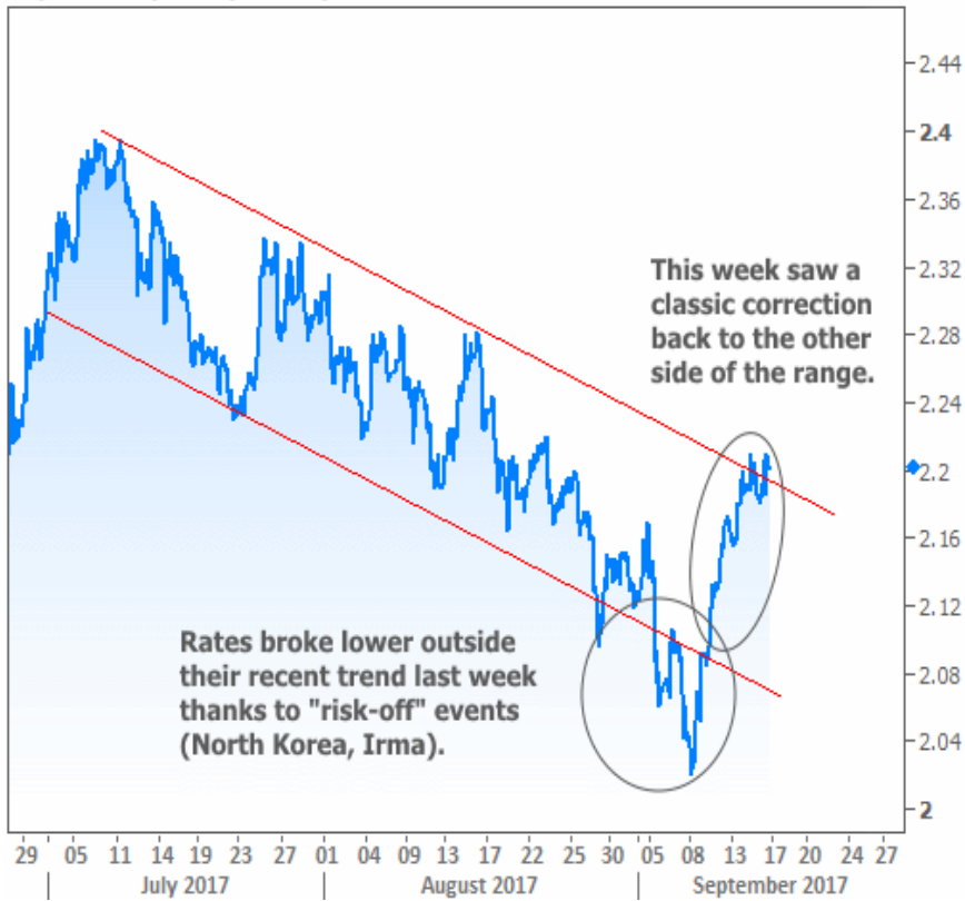
10yr Treasury Yield ("Rates")

The bulk of the correction took place during the first 3 days of the week. Rates found a supportive ceiling around 2.22% in terms of 10yr yields, but weren't interested in moving much lower for a few reasons. The most obvious reason would be that last week's gains were based on temporary factors.