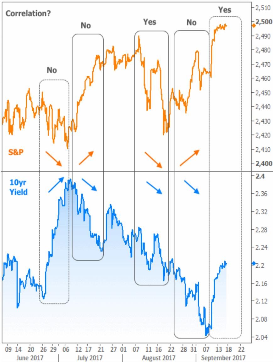
Stocks vs Bonds

Risky events, inflation data, and tighter monetary policy abroad all exert some influence on rates because they all inform the likelihood of the next Fed rate hike. The Fed isn't the only game in town when it comes to long-term rate momentum, but it is the most important .