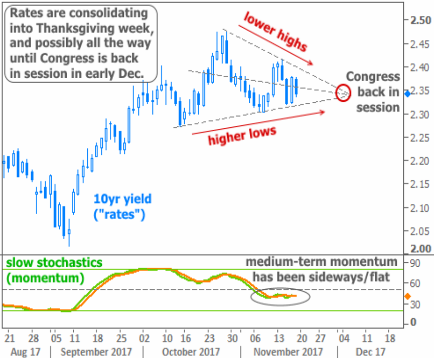
US 10yr Treasury Yield

In the spirit of "waiting and seeing," interest rates improved slightly this week. This keeps them locked in a consolidative trend (higher lows and lower highs) that's been underway for more than a month. It's the bond market's way of expressing indecision, and for now, the trend suggests indecision could linger at least through early December. Even if we apply some esoteric math to recent rate movement and derive a line that measures momentum, that line has been almost perfectly flat for several weeks.