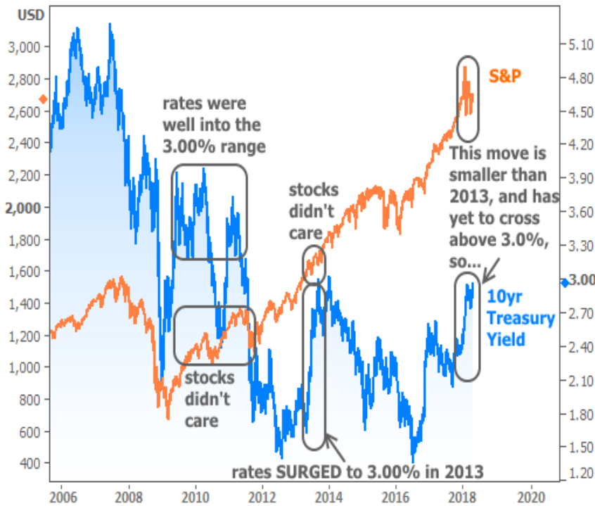
Stocks vs Bonds

How about the stock market? It was fairly tough to tune-in to financial news this week without seeing the rate spike being blamed for slumping stocks. Rather than bore you with words, I'll just leave the following chart right here ( conclusion: stocks didn't care about 3% 10yr Treasury yields in the past, nor did they care about a much bigger rate spike in 2013):