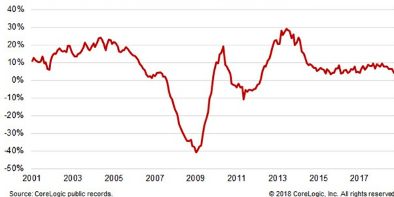
Figure 3: Year-Over-Year Change in California's Median Sale Price

Even with the slowdown in appreciation, the 4.1 percent annual gain was the lowest since June 2016, buyers still face large affordability challenges . The monthly principal and interest payments on a median priced home purchased in September was up three times the rate of appreciation - 12.8 percent - because of approximately an 80 basis point gain in mortgage rates over that period.