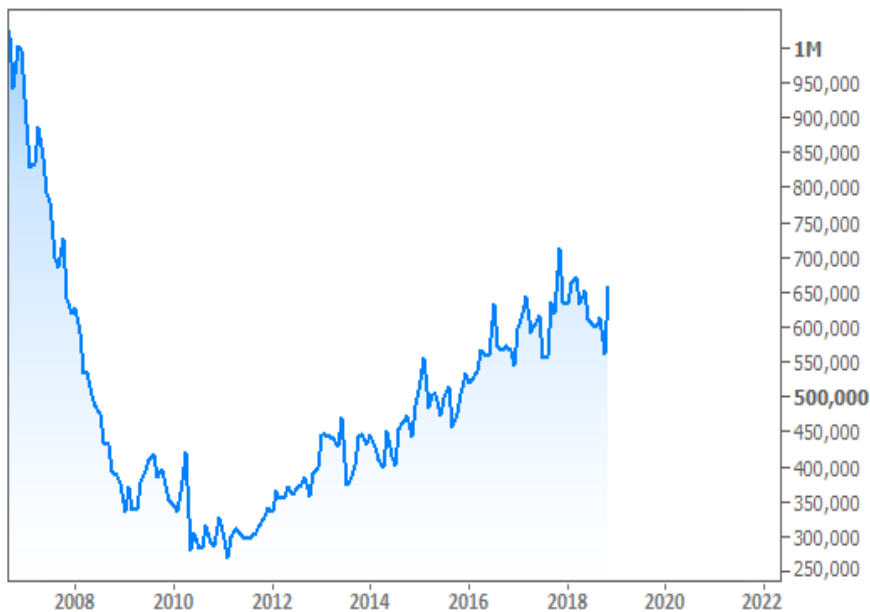
New Home Sales

In the same report, median prices of new homes had a completely different experience. They fell sharply.