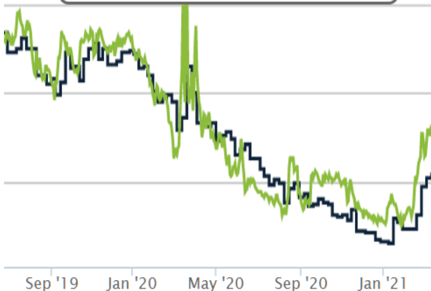
30yr Fixed Mortgage Rates — Freddie Mac Weekly Survey Rates (purchase) — Actual Daily Average Rates (Including Refis)

It's March 2021, and you'd now have to go back to March 2020 to see higher mortgage rates. It will take mainstream media a while to get caught up with this new reality because the most widely cited mortgage rate survey tends to lag behind sharp moves like this.