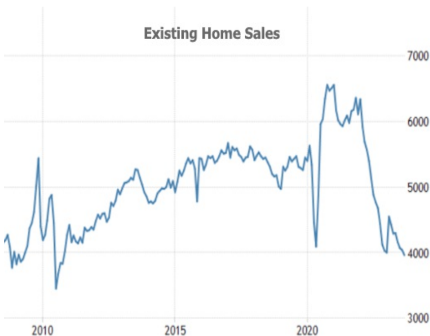
Existing Home Sales

TRADINGECONOMICS.COM | NATIONAL ASSOCIATION OF REALTORS