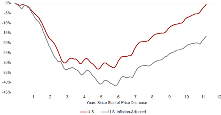
Change in Home Price Index Since Start of Declines (2006)

Boesel says inflation should also be factored into the pace of recovery. From the peak in housing prices through this past July, the inflation has totaled just under 18 percent. When home prices are adjusted for that, the trough was deeper , down 40 percent from the beginning of the cycle, and the recovery shallower; prices remain 17 percent off the peak.